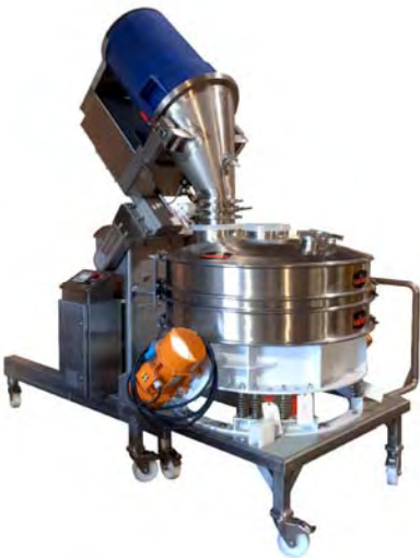
Portable Drum Tilter to interface with custom portable screener (with fully contained product transfer)

Supplying the right solution for most drum handling challenges is rarely “one size fits all.” That’s why everything we do is custom designed to meet your specific needs. Whether it’s a variety of drums sizes or dealing with difficult powders, IEDCO is able to supply you with a personalized system to make your next project successful. Here are just a few examples: