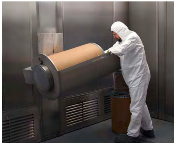
Custom Drum Tilter to handle multiple sized drums within a specially designed downflow booth to handle hazardous materials in a safe and ergonomic fashion.