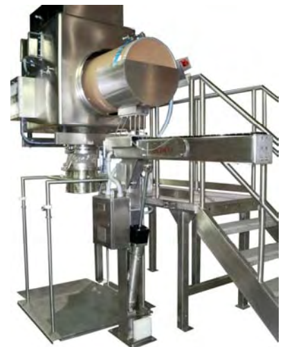
Drum Lift & Tilter integrated into a custom glovebox and bulk bag filling system for a fully contained transfer system.